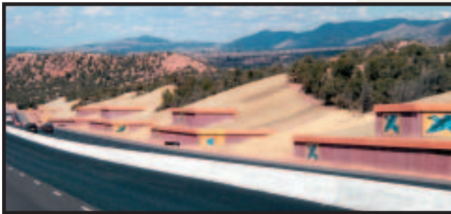
Each wall is parallel to the adjacent roadway slope.

The other modification was the utilization of sloped leveling pads