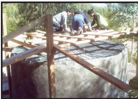
Work underway on ferro-cement chlorination vault in Peru

To learn more about EWB-USA, visit their website at www.ewb-usa.org .