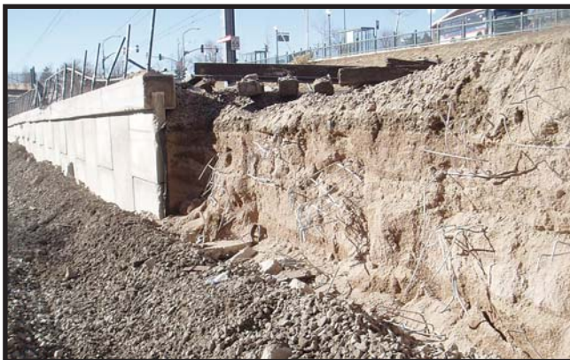
Dismantled MSE Wall, Jan 19