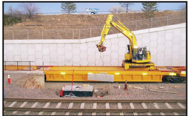
Reconstruction underway, Jan 20