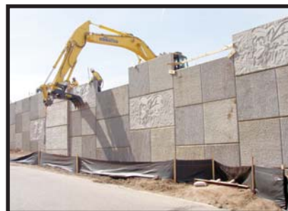
Construction now underway on 'FasTracks'

mately 30% of the retaining walls. Construction of the retaining walls is underway and is expected to continue through 2010. RECo's work is being carried out by the RECo USA Western Regional office in Englewood, Colorado.