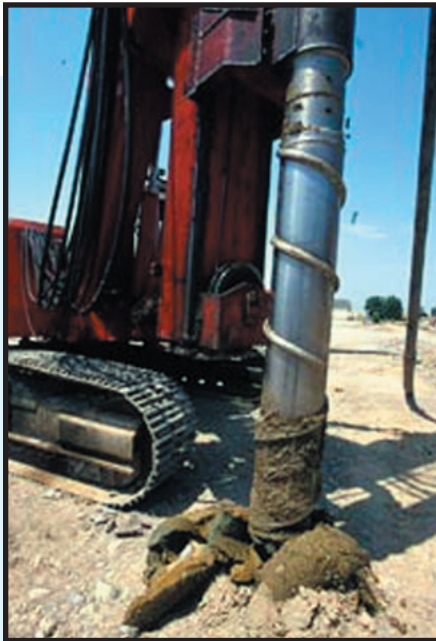
Reverse auger displaces the soil laterally, with virtually no spoil

In Burlington, VT owner Lowe's Home Centers recently awarded a project to DGI-Menard. The large site was underlain with 15m of soft clay which was improved with our alternate design and technologies. The original project design called for either wick drains and surcharge, with a time factor that would take the building construction into 2005, or an alternate design using Vibro Concrete Columns (VCC) as direct support of the embankment fills and building loads.