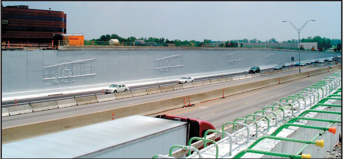
Each of the images, approximately 1 meter high and 3.6 meters long, are placed at varying heights along the MSE structures to give motorists the illusion of flight as they drive by.

When completed, the reconstruction of the I-70/75 interchange near Dayton will provide much needed relief to Ohio's business community and motoring public, reducing lost time and money resulting from constant traffic congestion and daily accidents. The new interchange, created by Ohio Department of Transportation's design consultants CH2M Hill of Dayton, incorporates 50 years of highway design to replace the 1950 cloverleaf intersection. The new interchange eliminates the weaving movement pattern of the old design and should reduce accident rates which are currently twice the state's average.